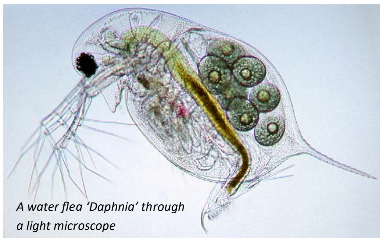
A water flea 'Daphnia' through a light microscope

A Level students and those attending the Microscopy Club are able to use high-quality light microscopes to take their knowledge of microscopy to a level above that normally developed in the classroom. The Bluetooth-enabled microscopes allow images to be viewed on smart phones or iPads, thus enhancing the potential for exploration and learning.